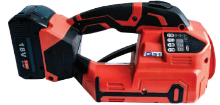
BATTERY OPERATED MACHINE