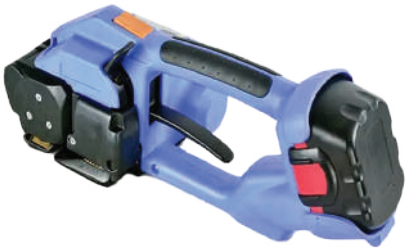
BATTERY POWERED STRAPPING TOOL