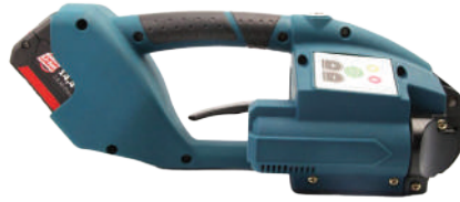
BATTERY POWERED STRAPPING TOOL