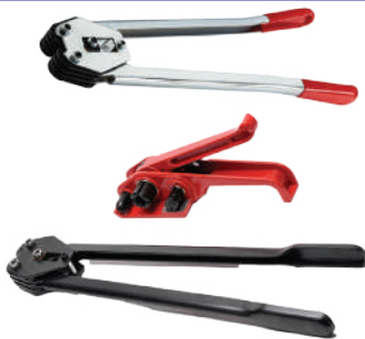
MANUAL TENSIONER & SEALER