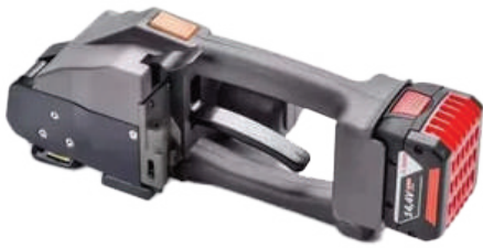
BATTERY POWERED STRAPPING TOOL