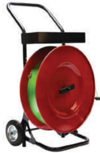
PET STRAP DISPENSER