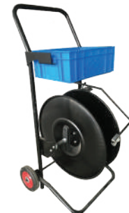
PP STRAP DISPENSER