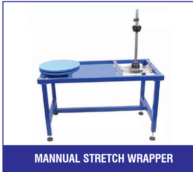
MANNUAL STRETCH WRAPPER