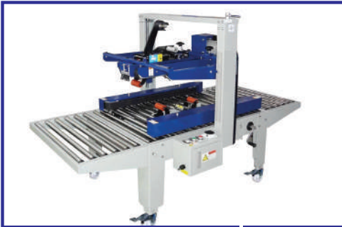
AUTOMATIC CARTON SEALER