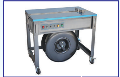
SEMI-AUTOMATIC STRAPPING MACHINE