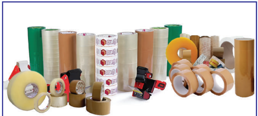
BOPP ADHESIVE ROLL