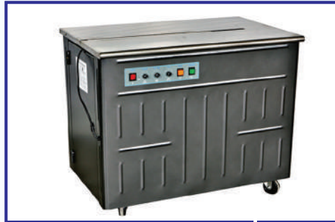
BOX STRAPPING MACHINE